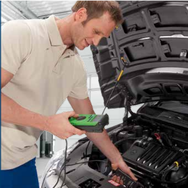
Voltage test (MMD 302): The glow plug has to be replaced