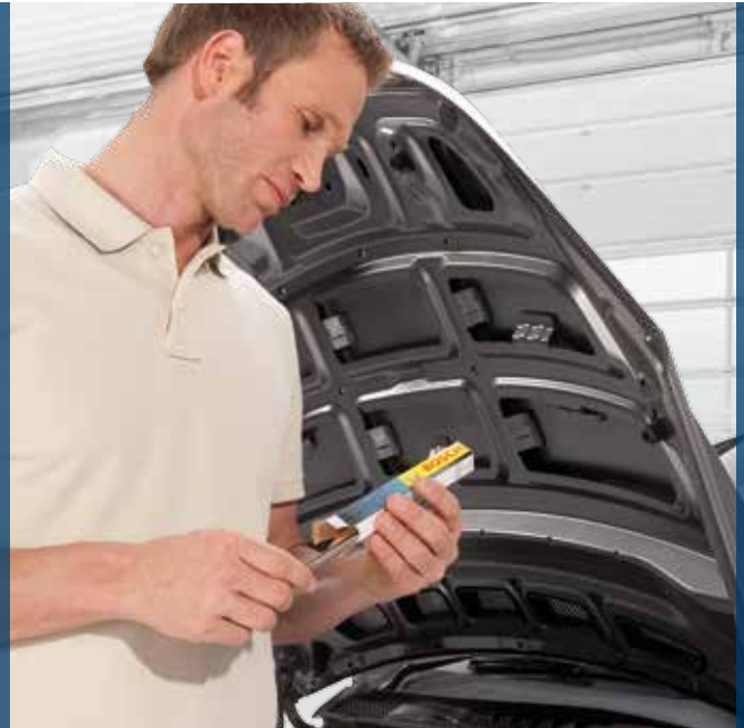
Found quickly: Matching Bosch glow plug from the range