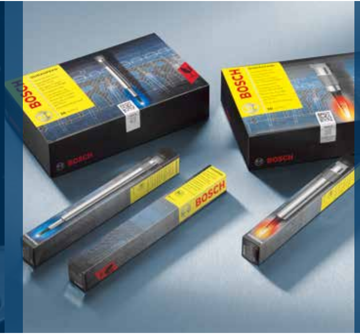
Bosch Duraterm and Bosch DuraSpeed: Packs of 10 or individual packs