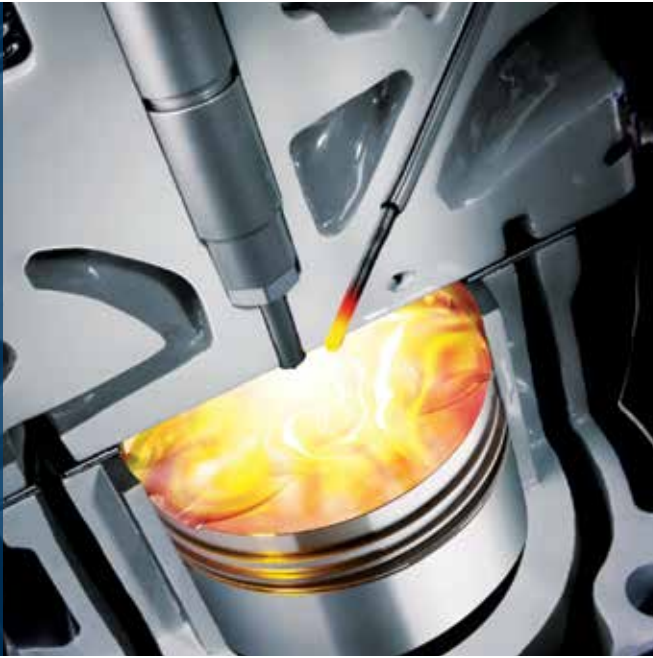
Clean combustion: Protects the environment and the engine