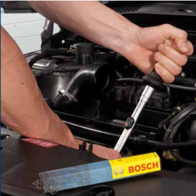
Installation: Tighten with the right torque