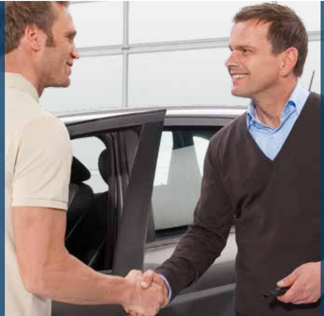
Satisfied in every way: Professional service convinces your customers