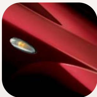
293 Flamenco Red Metallic