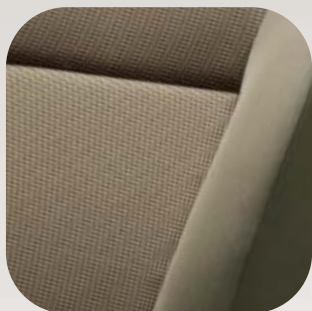
150 Beige Cloth