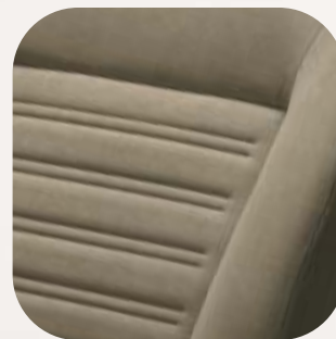
618 Beige Castiglio™