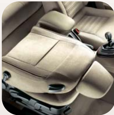
Fold-down front passenger seat.