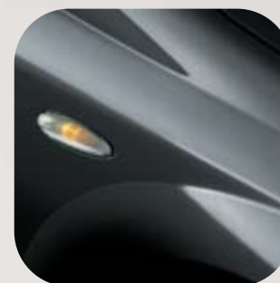
284 Techno Grey Metallic