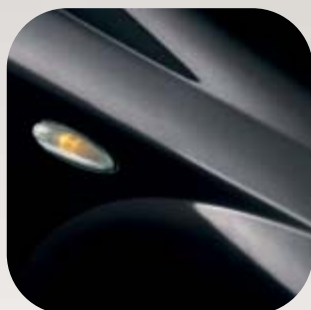
601 Darkwave Black Solid