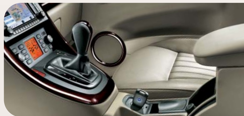
Centrally placed ergonomic console.

There is a choice of transmissions to precisely match your driving style. Petrol engines can be specified with 5-speed manual or a sequential automatic. Diesel engines get a 6-speed manual or sequential automatic, which is the sole choice on the powerful 2.4 20v MultiJet.