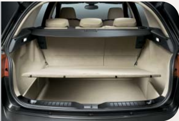
Double luggage compartment that creates extra space.

The new Croma's luggage compartment isn't just big, it's also extremely versatile. The 500 litres of space increases to 1610 litres when the rear seats are folded. And the magic touch? An ingenious double luggage compartment that creates a secret space for valuables and a 'new' floor at seat level for stowing luggage on a flat surface.