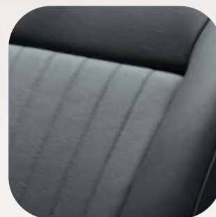
432 Dark Grey Leather