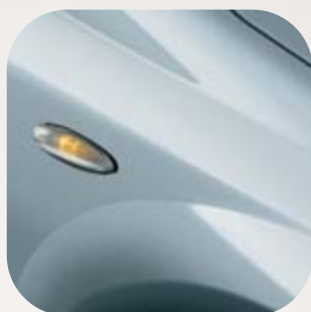
260 Dub Azure Metallic