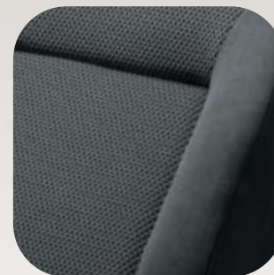
218 Dark Grey Velour