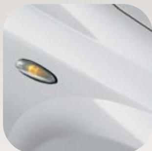
249 Ambient White Solid