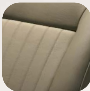
409 Beige Leather