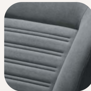
619 Dark Grey Castiglio™