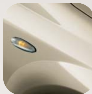
272 Spiritual Ivory Metallic