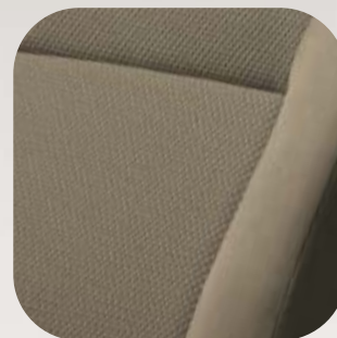
215 Beige Velour