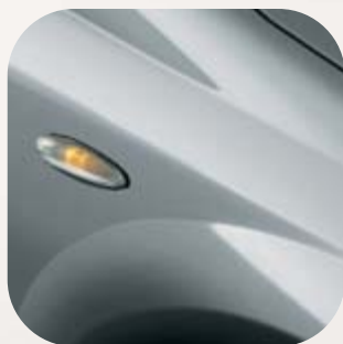
698 Lounge Grey Metallic