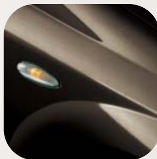
742 Chillout Brown Metallic