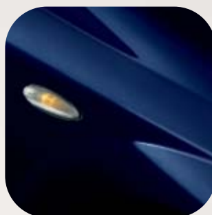
266 Jazz Blue Metallic