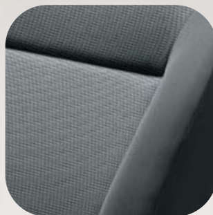
156 Dark Grey Cloth