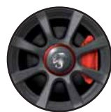
SPECIFIC ABARTH 8 SPOKE 16" ALLOY WHEELS PAINTED, 6.5JX16" WITH 195/45 R16 TYRES (CHAINABLE)