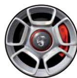
SPECIFIC ABARTH 5 PETAL 17" ALLOY WHEELS DIAMOND FINISH AND PAINTED WHITE, 7JX17" WITH 205/40 R17 TYRES (UNCHAINABLE)