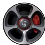
SPECIFIC ABARTH 5 SPOKE 17" ALLOY WHEELS DIAMOND FINISH WITH ANTHRACITE BACKGROUND, 7JX17" WITH 205/40 R17 TYRES (UNCHAINABLE)